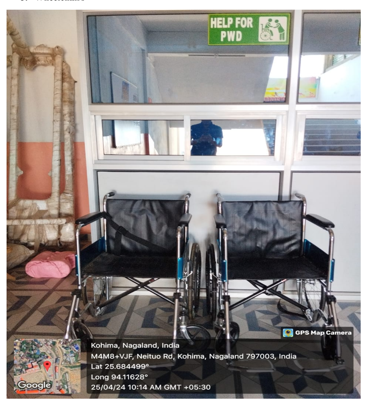
Parking for wheelchairs_Man corridor of the new building